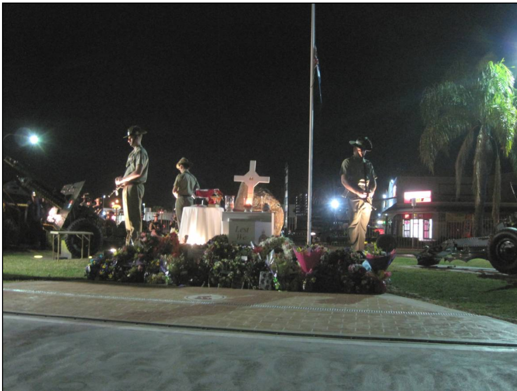
Vietnam Veterans 50 th Commemoration – Guns Memorial St Marys Outpost – St Marys RSL