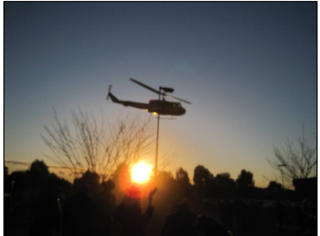
UH1 Huey helicopter lifting off from St Mary's Vietnam Veterans Outpost to start the 50 th Anniversary of Battle of Long Tan Service