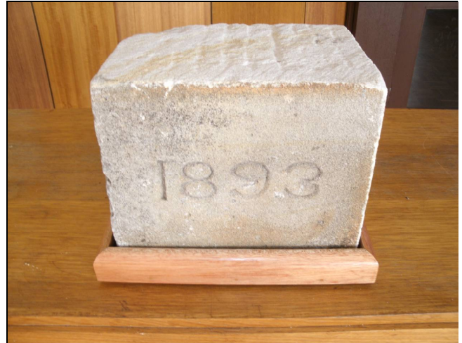
St Marys Methodist Church Foundation Stone.