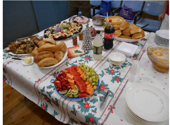
The feast set out before us.