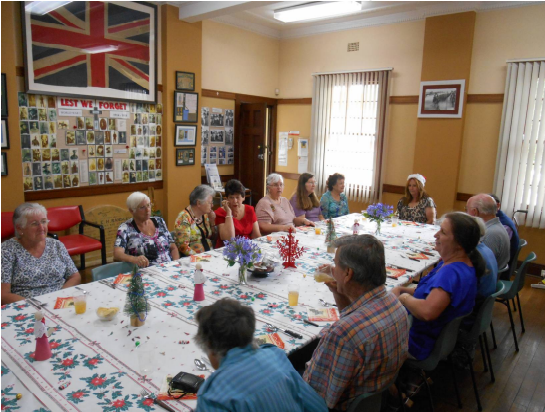
Our members waiting for the event to start.

Our Christmas party was held on the Saturday 13 th December 2014. A great time was had by all who attended.