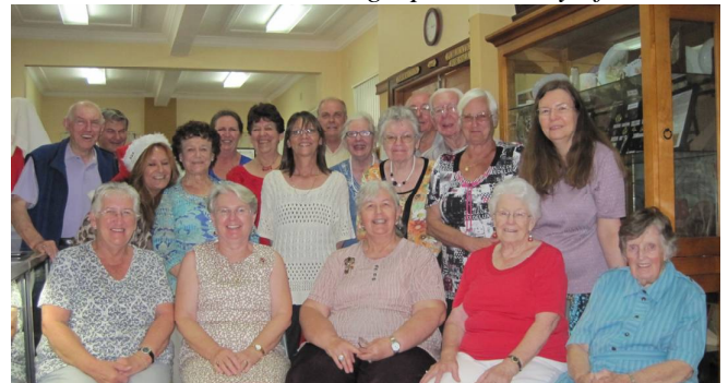
Our members posing for a group photo.